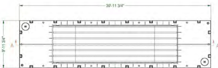
PLAN VIEW SCALE 1:75