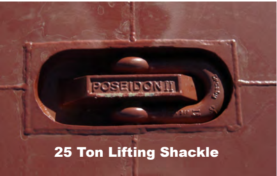
25 Ton Lifting Shackle